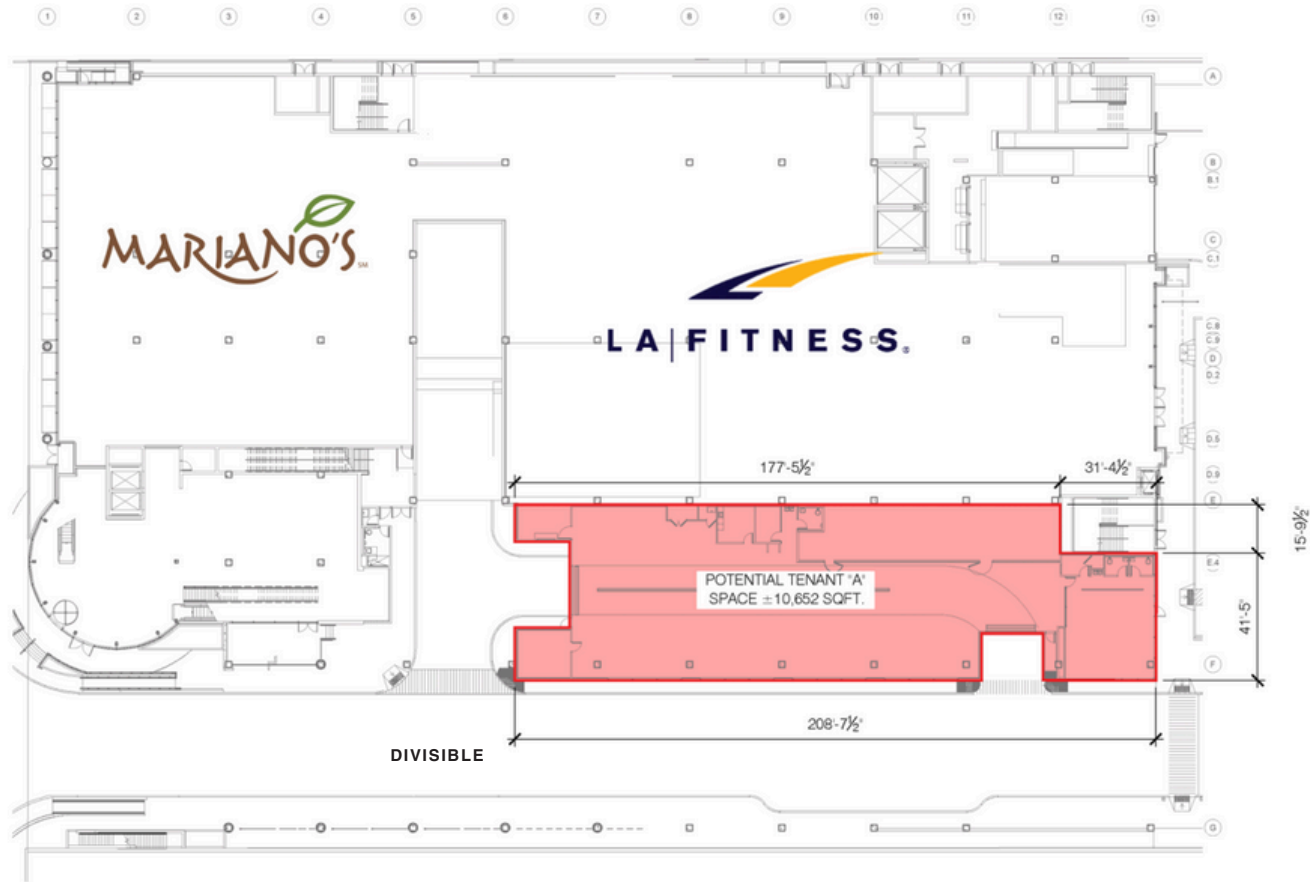
1 LOD1 PROPOSED LEVEL 1 PLAN