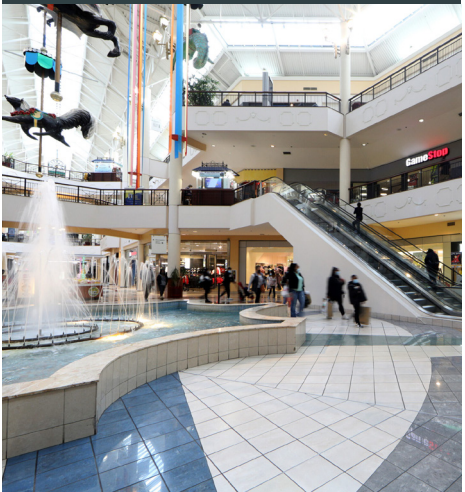
Willow Grove Park's signature fountain

Willow Grove Park is the premier retail and entertainment destination in Montgomery County, and one of the largest shopping centers in Pennsylvania. Averaging 5 million visits on an annual basis, this mall attracts a wide range of demographics with over 100 national retailers, onsite carousel and water fountain, over a dozen restaurant options, and year-round event programming for communities and families.