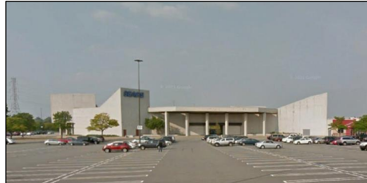
Space 2 Façade Facing Ring Road