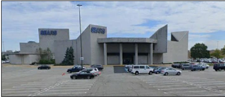
Space 1 Façade Facing US Route 1