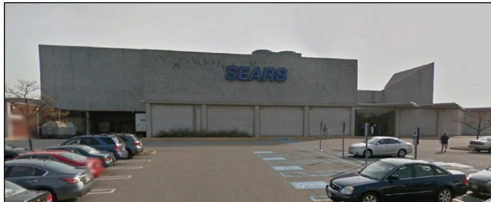
Space 3 Façade Facing North