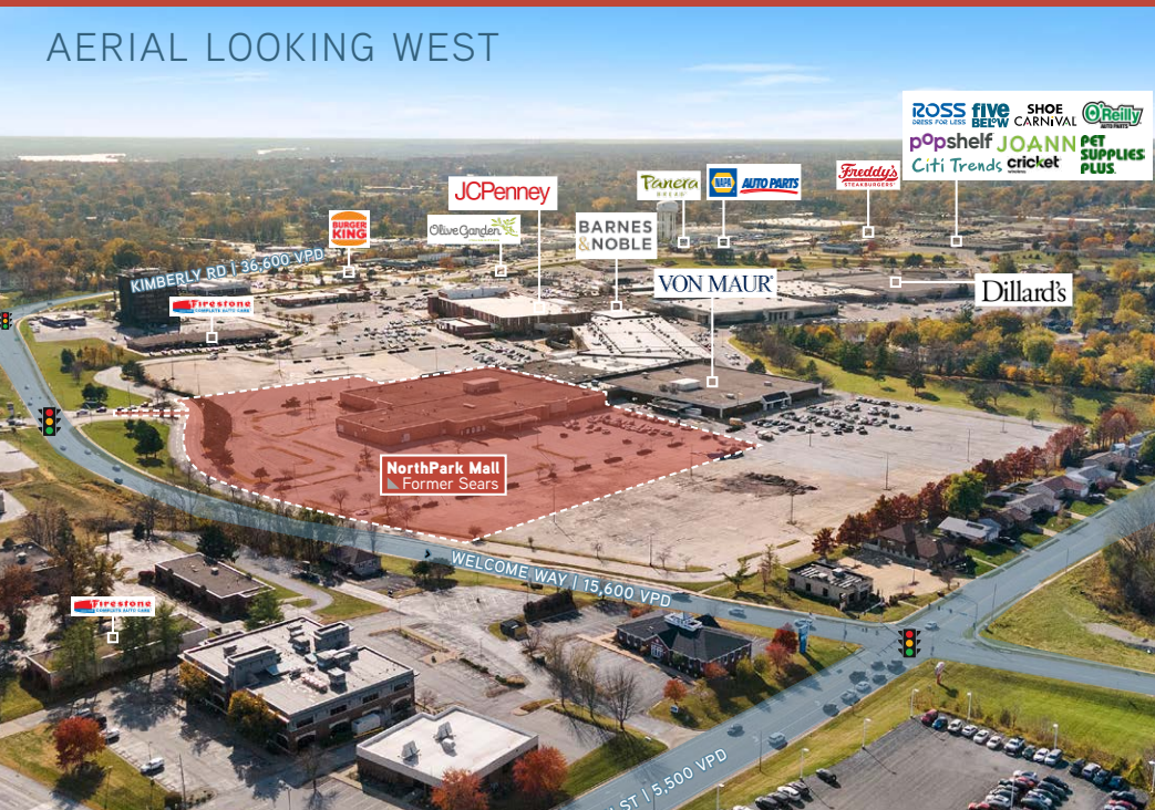
AERIAL LOOKING WEST