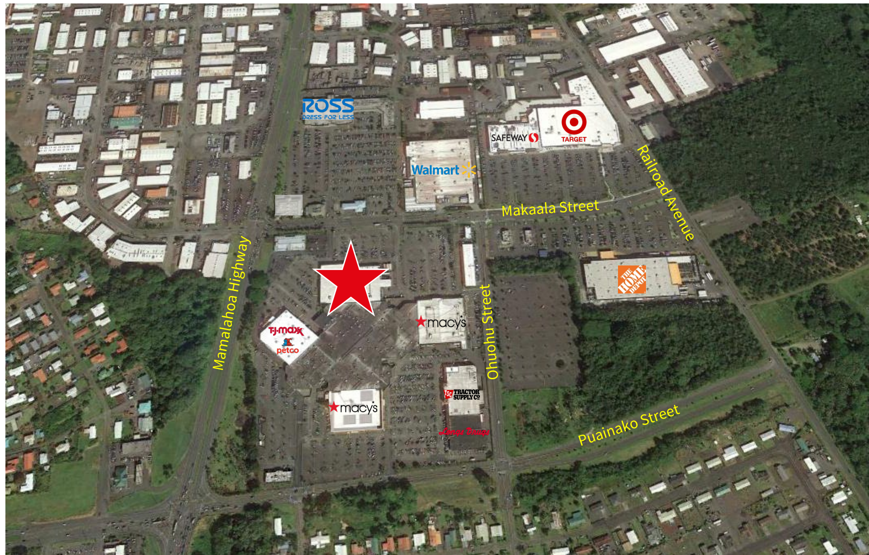
PRINCE KUHIO PLAZA