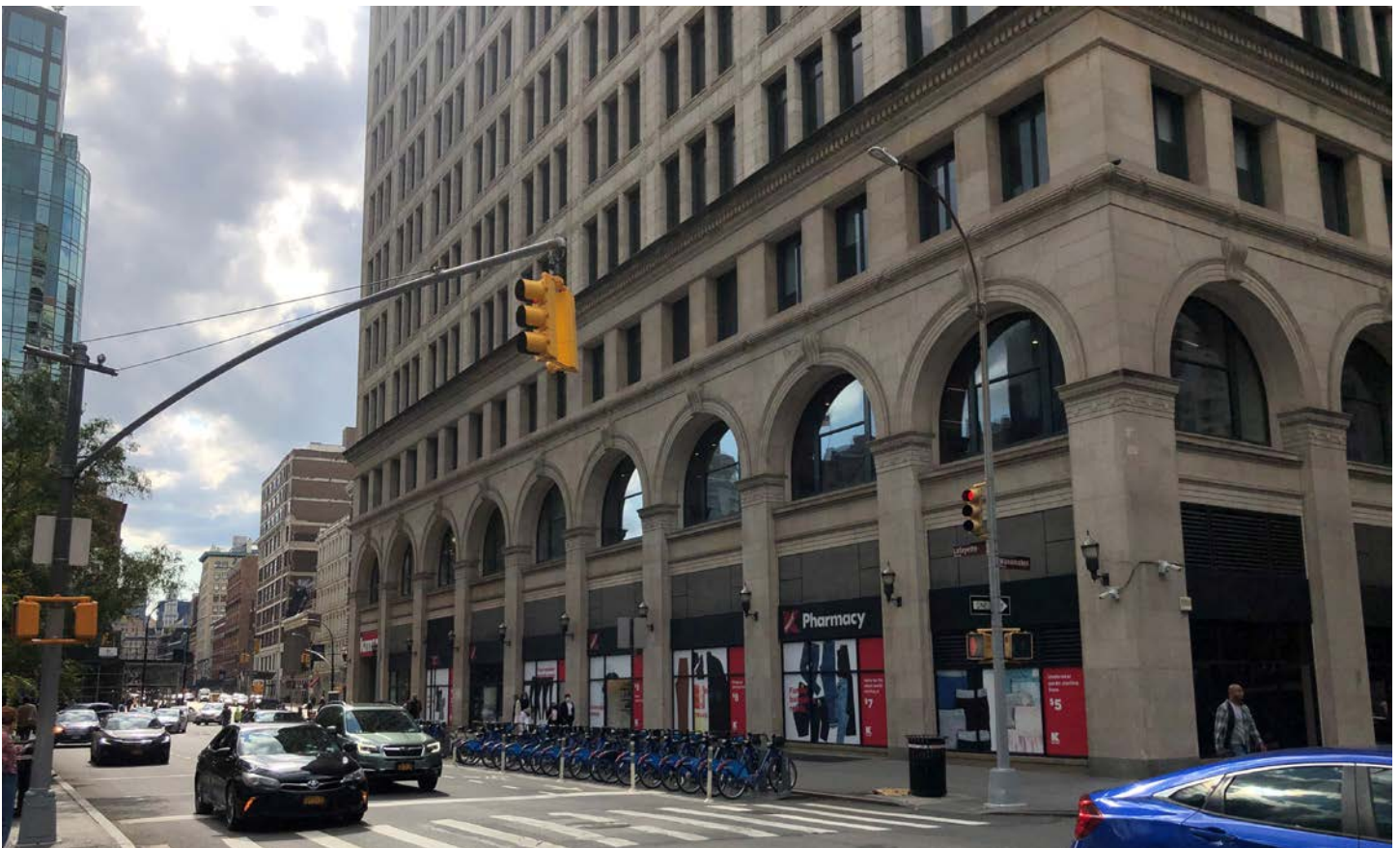
View Looking South Along Lafayette Street

Jones Lang LaSalle Brokerage, Inc. | 330 Madison Avenue New York, NY 10017 DISCLAIMER