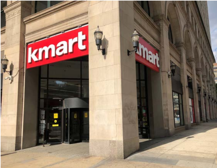
View of Main Entrance