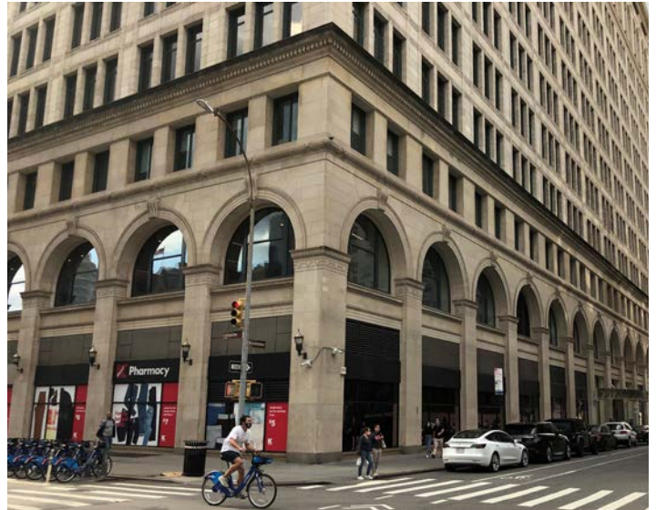
Southwest Corner of Lafayette & East 9th Street