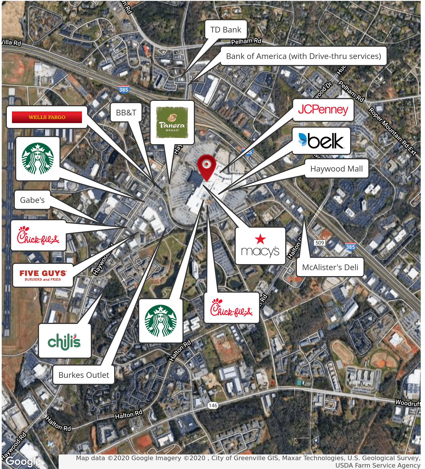
Map data ©2020 Google Imagery ©2020 , City of Greenville GIS, Maxar Technologies, U.S. Geological Survey, USDA Farm Service Agency