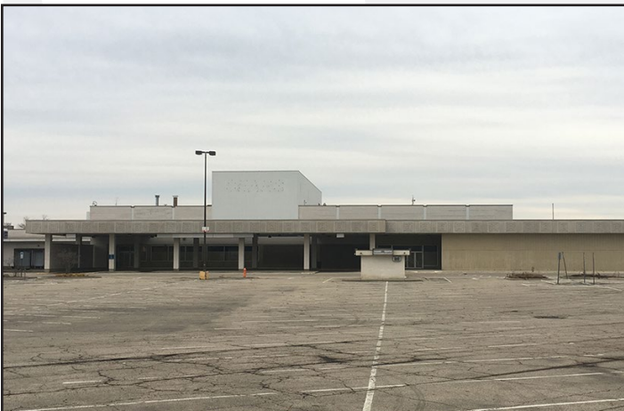
View facing Northeast