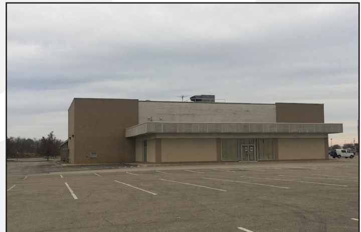
Auto Center Building