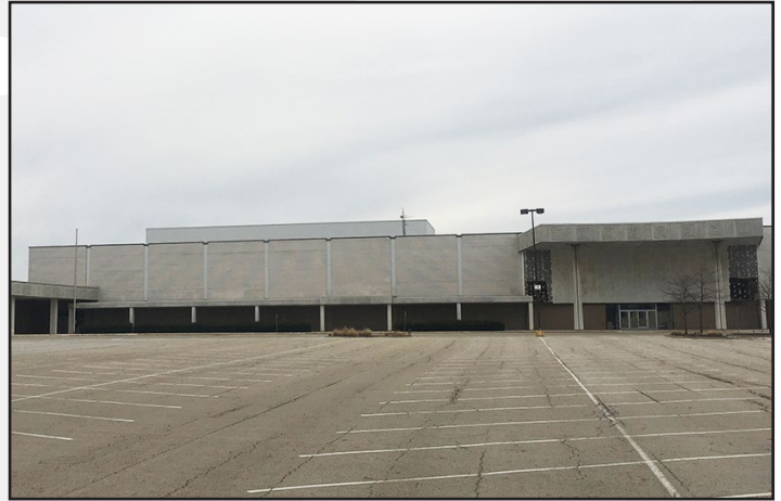
View facing Northwest