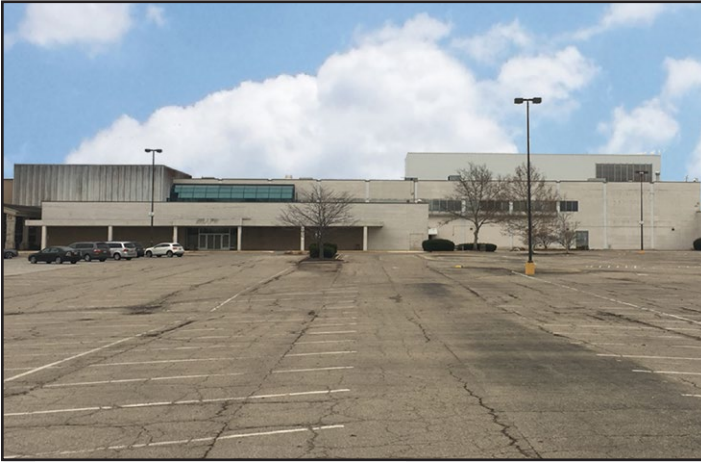
View facing Southeast